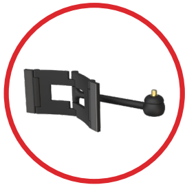
VMA 200-DM Side Display Mount