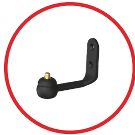
VMA 200-WM Wall Mount